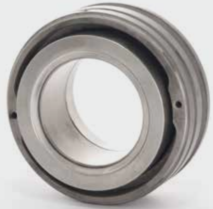
Quality Cartridge sealing technology for professionals

InjectionSystem or radial wear plates: this is how we can extend the lifetime of our rotary lobe pumps.