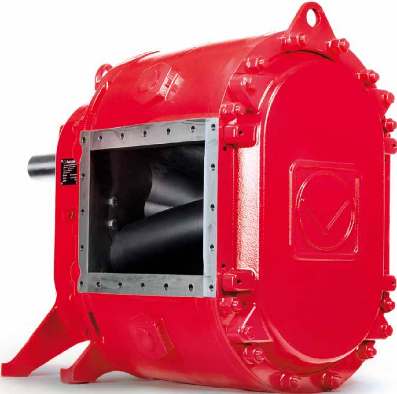
Rotary lobe pump of the VX series