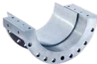
Radial wear plate

InjectionSystem or radial wear plates: this is how we can extend the lifetime of our rotary lobe pumps.