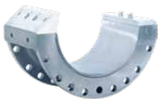
Pump housing segment with Injection module

The VX series is available in the huge range of materials needed for the very stringent requirements in the sugar industry, such as stainless steel for molasses or magma at high temperatures, or a coating of tungsten carbide for very abrasive media.