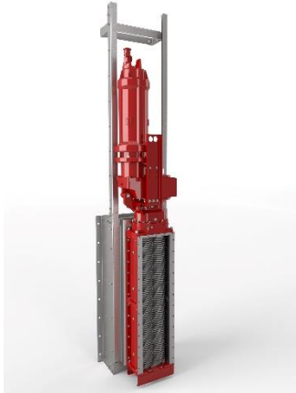
Image 1: The XRipper XRC is particularly suitable for open channels and shafts.