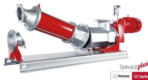
Image 6: The progressive cavity pump CC series with innovative SERVICEplus concept