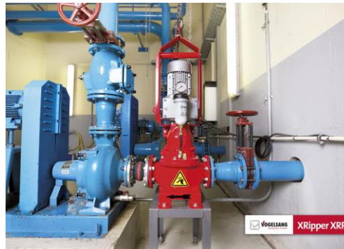
Image 2: The XRipper XRP for installation in confined spaces (application image)